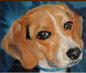
THE PAINTING OF MAGGIE