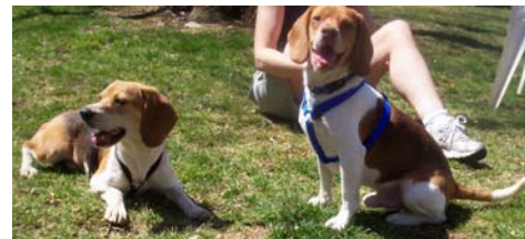
Limington Beagles Alton (left) & Loverboy (LB) (right)