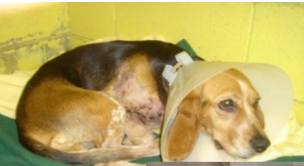
Meg before (top) & now