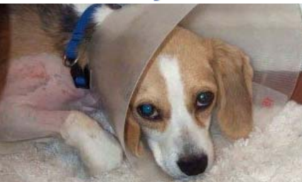
Franco before (top) & now